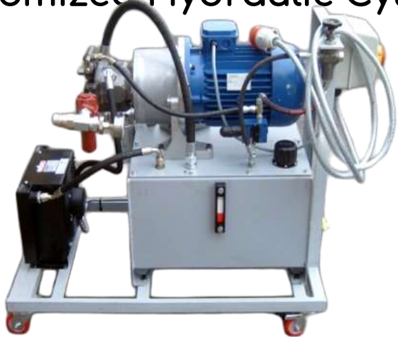
Customized Hydraulic Power Pack