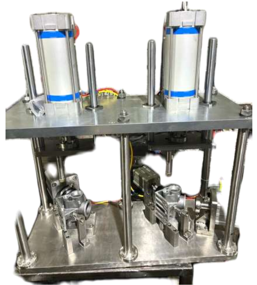
Leak Test Fixtures