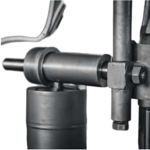
Customized Hydraulic Cylinders